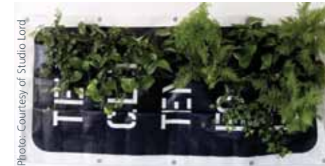
WallGreen, a vertical garden made from recycled PVC banners

Sustainable Additives: We will review the use of PVC additives and move towards more sustainable additive systems.